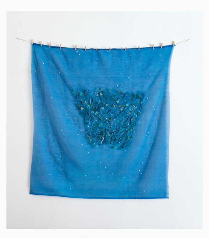
SOPHIE BENINI Meadow Under The Stars, 2019 Stitches on Organza, organza beads 43.31h x 39.76w in 110h x 101w cm SOB001