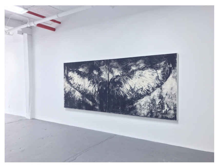
Juliette Dumas, "Whale Fluke (Night)" (2018), clay and gouache on paper mounted on canvas, 60 x 144 in

Titled Angels , the show consists of a half-dozen paintings of various dimensions, several quite large, presented in a two-panel format that employs its dividing vertical as an axis for the symmetrical image of a whale's flukes. The notion that flukes resemble an angel's wingspread is a troublesome allusion in the context of a subject that has borne more than its share of mawkish hyperbole. Yet its vaguely ethereal connotation is surprisingly adaptable to the unusual thesis with which Dumas paints her subject. Each work's actual title is more pragmatic, basically "Whale Fluke" followed by a citation of a distinguishing feature, either a color scheme or a name, like Charlie or Neri — names, I assume, of living and breathing whales.