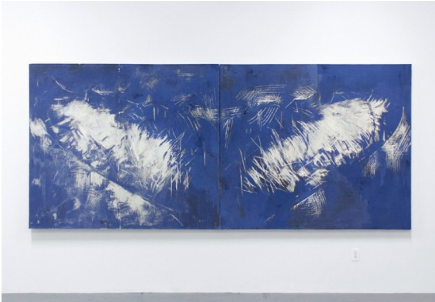
Juliette Dumas, Whale Fluke (Le Grand Bleu), 2018. Clay and gouache on paper mounted on canvas, two panels, total 60 x 144 inches.