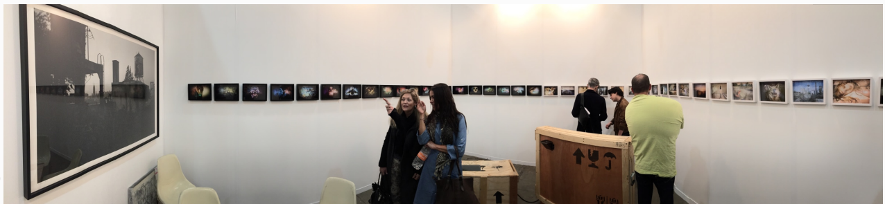
ADOLFO DORING installation at ZONA MACO